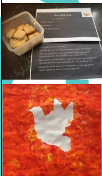
Jess (Y4) made some delicious shortbread, and typed up the instructions. She has also done some amazing art!